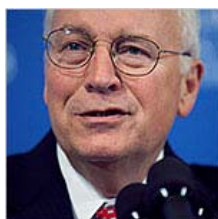
Room for Debate: Tips for Cheney's Memoirs