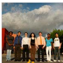
Valedictorians Prepare for the Future