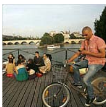
The Frugal Pleasures of Paris in Summer