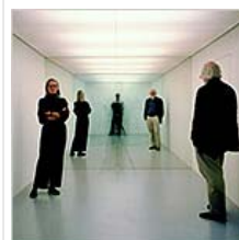
Art: Conceptual Artist Insists He's Just Playing