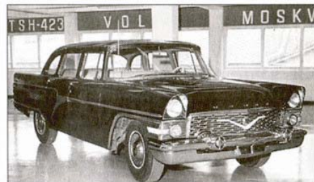
Cars of the commissars, clockwise from top left: Zis-110 7-seat convertible and sedan; 1964 Chaika M-13; 1953 Pobeda; 1952 Zim.